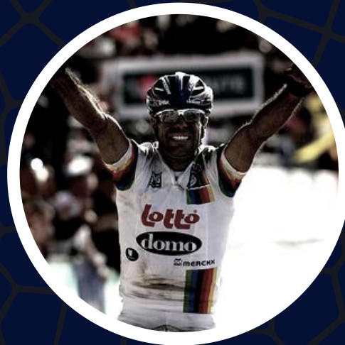
Peter van Petegem